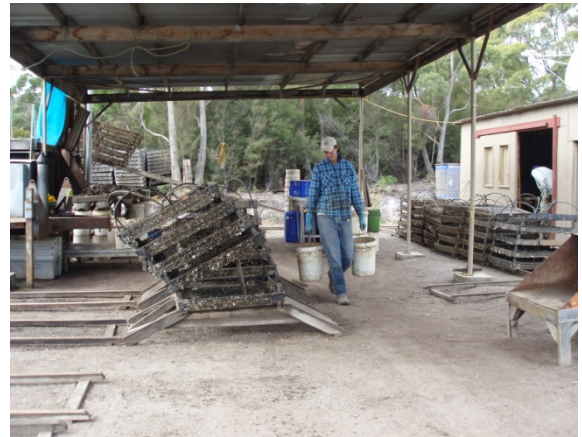
Early days saw staff working in an open sided shed with a dirt floor