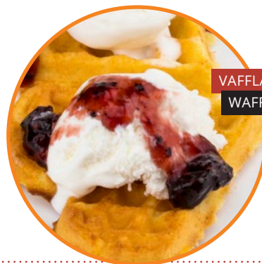
VAFFLA MEÐ RJÓMA OG SULTU WAFFLE WITH CREAM & JAM