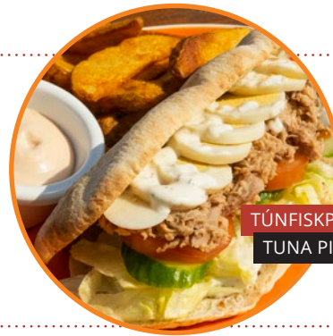
TÚNFISKPÍTA / LANGLOKA TUNA PITA SANDWICH

3 Túnfiskpíta Tuna Pita Sandwich 2.250,- Píta með túnfiski, salati, tómötum, gúrku, soðnum eggjum, majones og langlokubrauði. Borin fram með frönskum. Tuna fish, salad, tomato, cucumber, boiled eggs, mayonaise and bread. Served with fries.