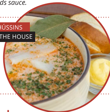
FISKISÚPA HÚSSINS FISH SOUP OF THE HOUSE

7 Fiskisúpa hússins FISH SOUP OF THE HOUSE 1.950,- Með brauðbollu og íslensku smjöri. Served with a loaf of bread and icelandic butter.