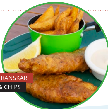
FISKUR & FRANSKAR FISH & CHIPS